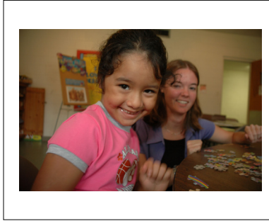
Studying God's Word is fun

Union Mission offers daily worship through our chapel program Monday through Friday. We meet at 5:00 PM for worship. It is designed for the family and we encourage you to come and worship with us. We also invite you to stay for dinner at 5:30, to continue